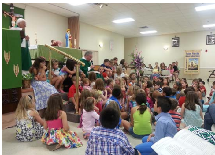
Children's Mass, October 4, 2015