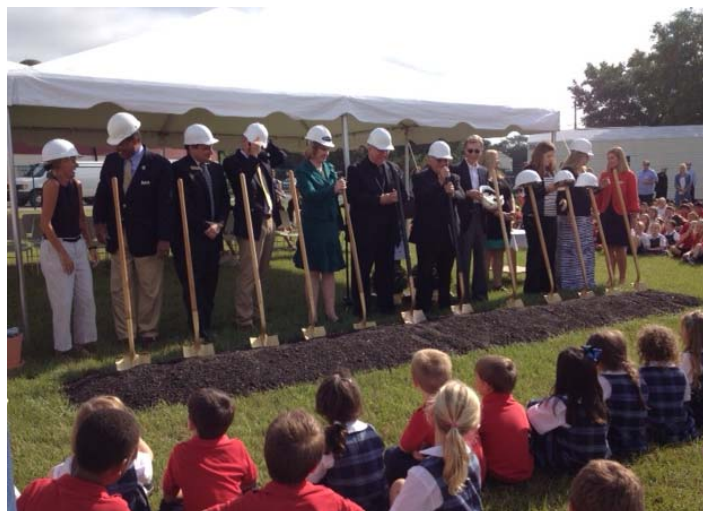
Zazarino Groundbreaking, October 2, 2015

You may also see these on the web at: www.vatican.va/archive/ENG0015/P7Z.HTM