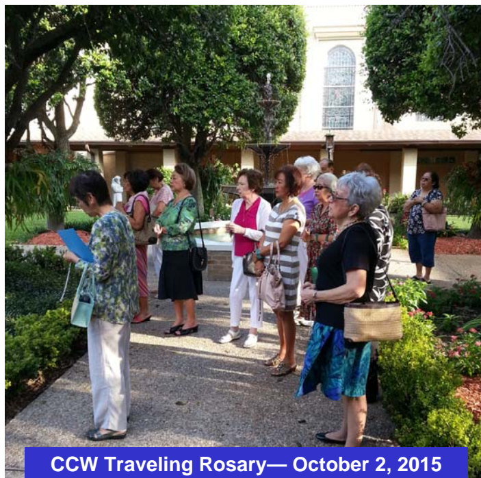
CCW Traveling Rosary— October 2, 2015

The Church should always be a place of sanctuary, of quiet, peace and prayer. Please be mindful and respect other's needs. Do not speak loudly before the Blessed Sacrament, and go outside for conversations. Thank you.