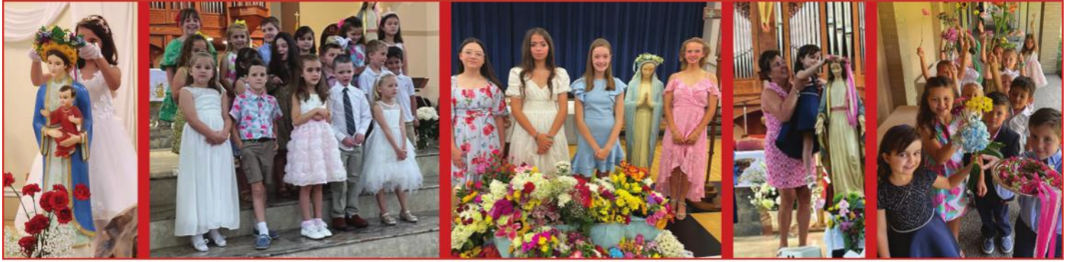
This month we honored Blessed Mary as the Mother of Jesus and our Heavenly Mother.