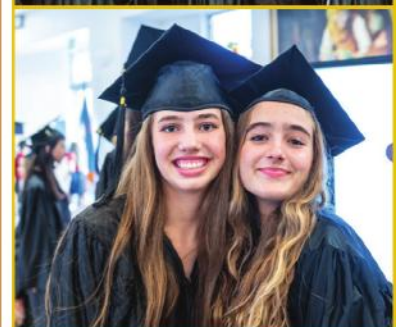
Congratulations to the 8th Grade Graduates of St. Martha School and St Mary's Academy. View this bulletin online at www.DiscoverMass.com